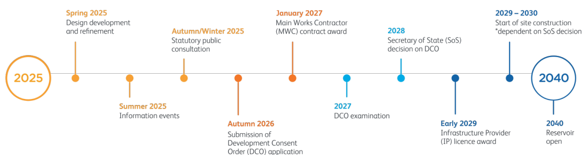
Figure 3-1: Key Project milestones